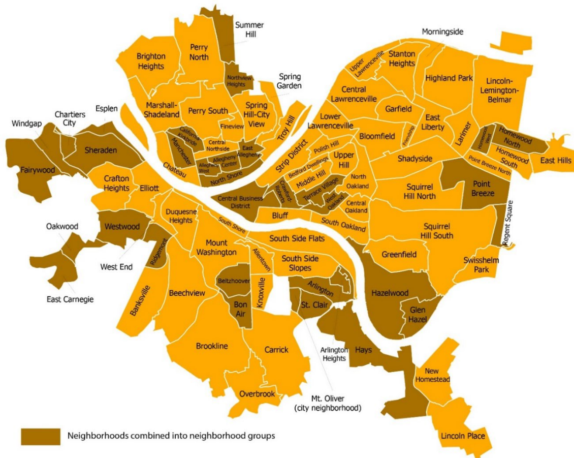
City of Pittsburgh Neighborhoods and Neighborhood Groups

The figure below highlights all 90 neighborhoods currently defined by the City of Pittsburgh, and shows which neighborhoods were combined into larger neighborhood groups for the purposes of this report.