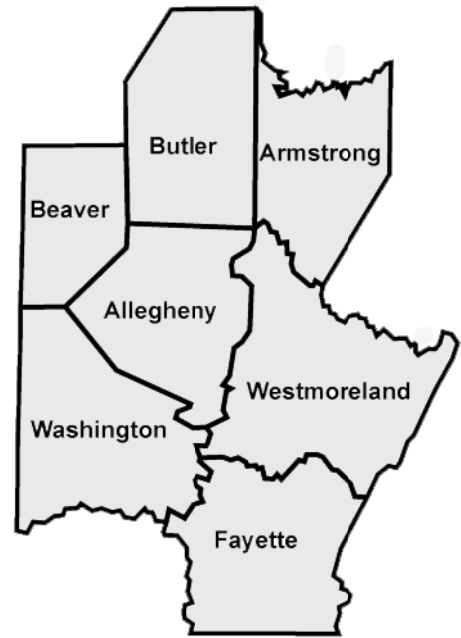
Figure 1. Counties of the Pittsburgh Metropolitan Statistical Area

Presented in this report is employment data by race, occupation and gender compiled by the place of work for individual workers at the time of the 2000 Census. This differs from employment data compiled by place of residence due to commuting patterns. The full EEO Special Tabulation includes separate compilations of employment data compiled by place of residence for most regions of the country. Employment compiled by place of residence for workers in the Pittsburgh Metro SA is one of seven regional datasets excluded from the EEO Special Tabulation because of confidentiality restrictions.